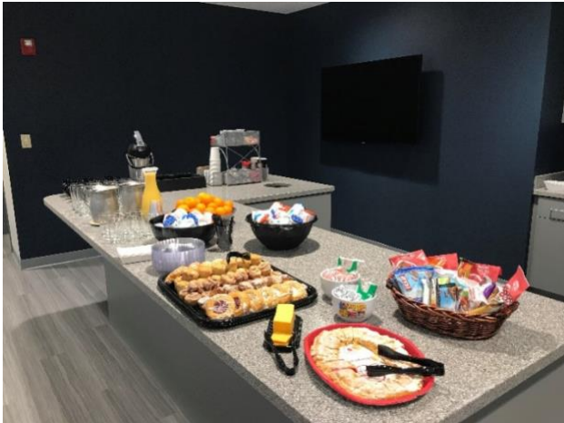
Kitchen/ Catering Space