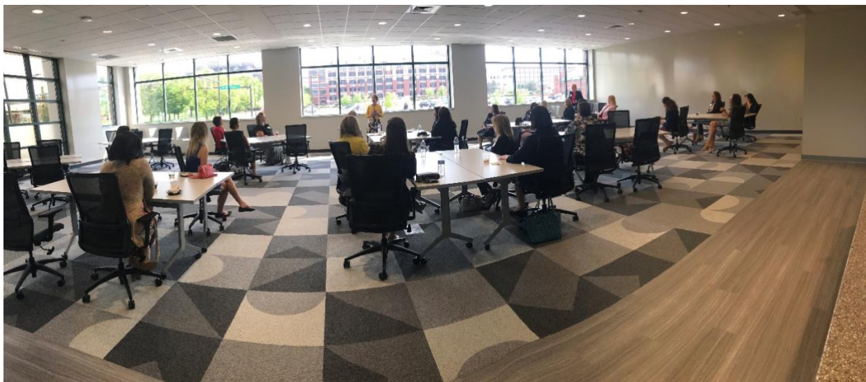
Small Group Seats: 20-35