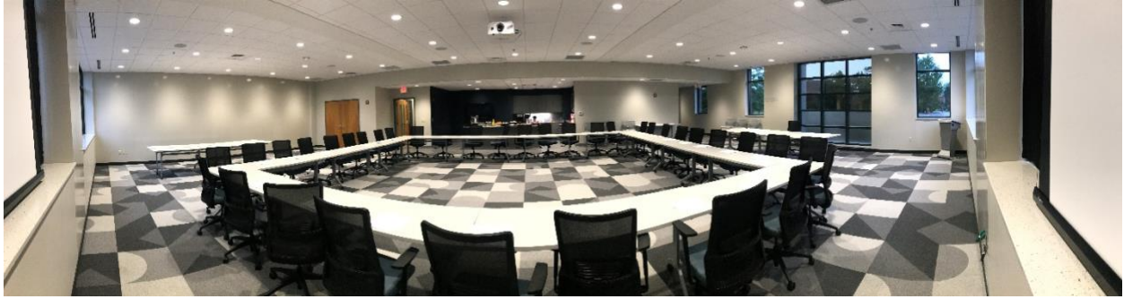
Large Square Seats: 20-30