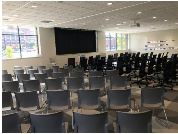
Classroom Seats: up to 85