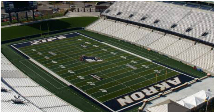
Employment in the Polymer Industry In Akron MSA